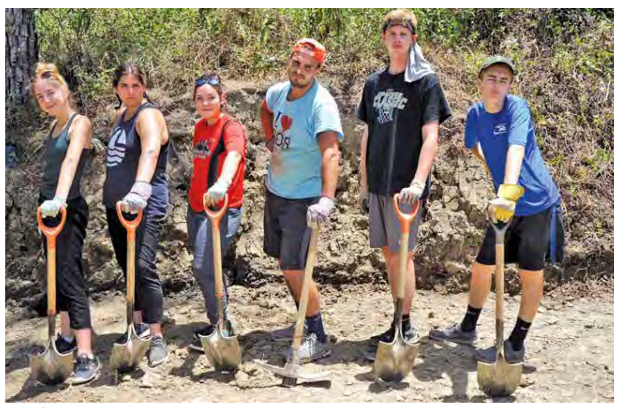
High School Ministry Dominican Republic Mission

hat an exciting summer it's been! These pages tell just a few stories of what God has done in and through First Pres this summer. Let's join in giving Him thanks and praying for the seeds that have been planted to grow and bear fruit.