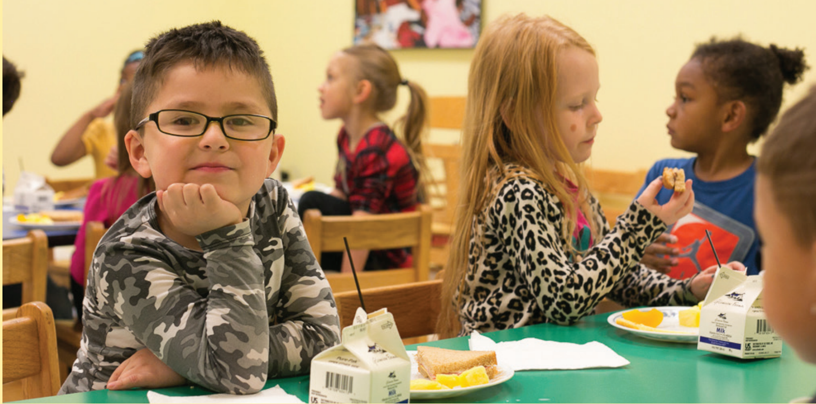
Get Set children receive a hot meal each day they attend school. Hundreds of volunteers throughout the years have made mealtime possible for the students.