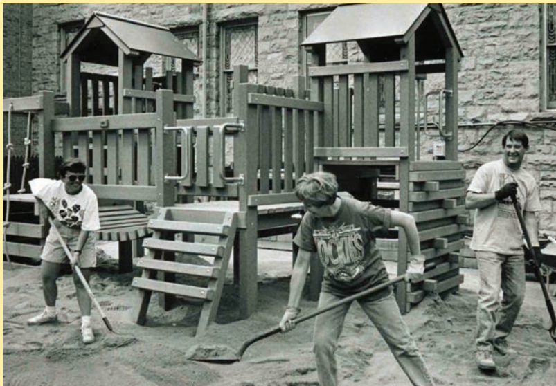
Installing the preschool playground