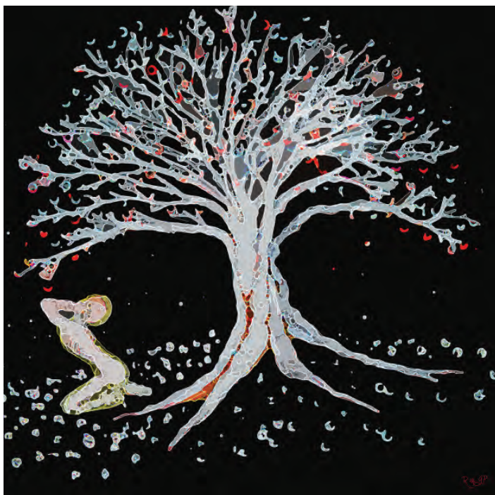
Agony in Gethsemane