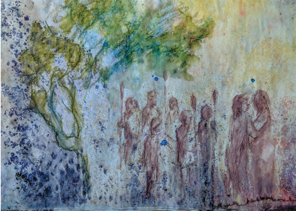
Betrayal / Pegi Ballenger